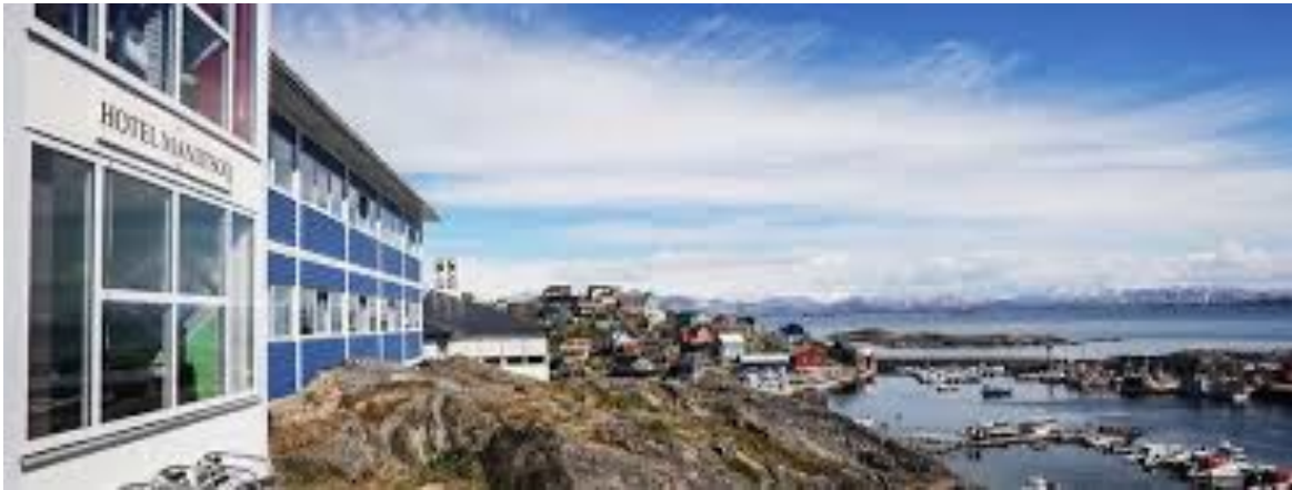
Hotel Maniitsoq offers a unique and picturesque setting for its guests. It is located across the harbor, providing stunning views of the Davis Strait. This area is known for being frequented by